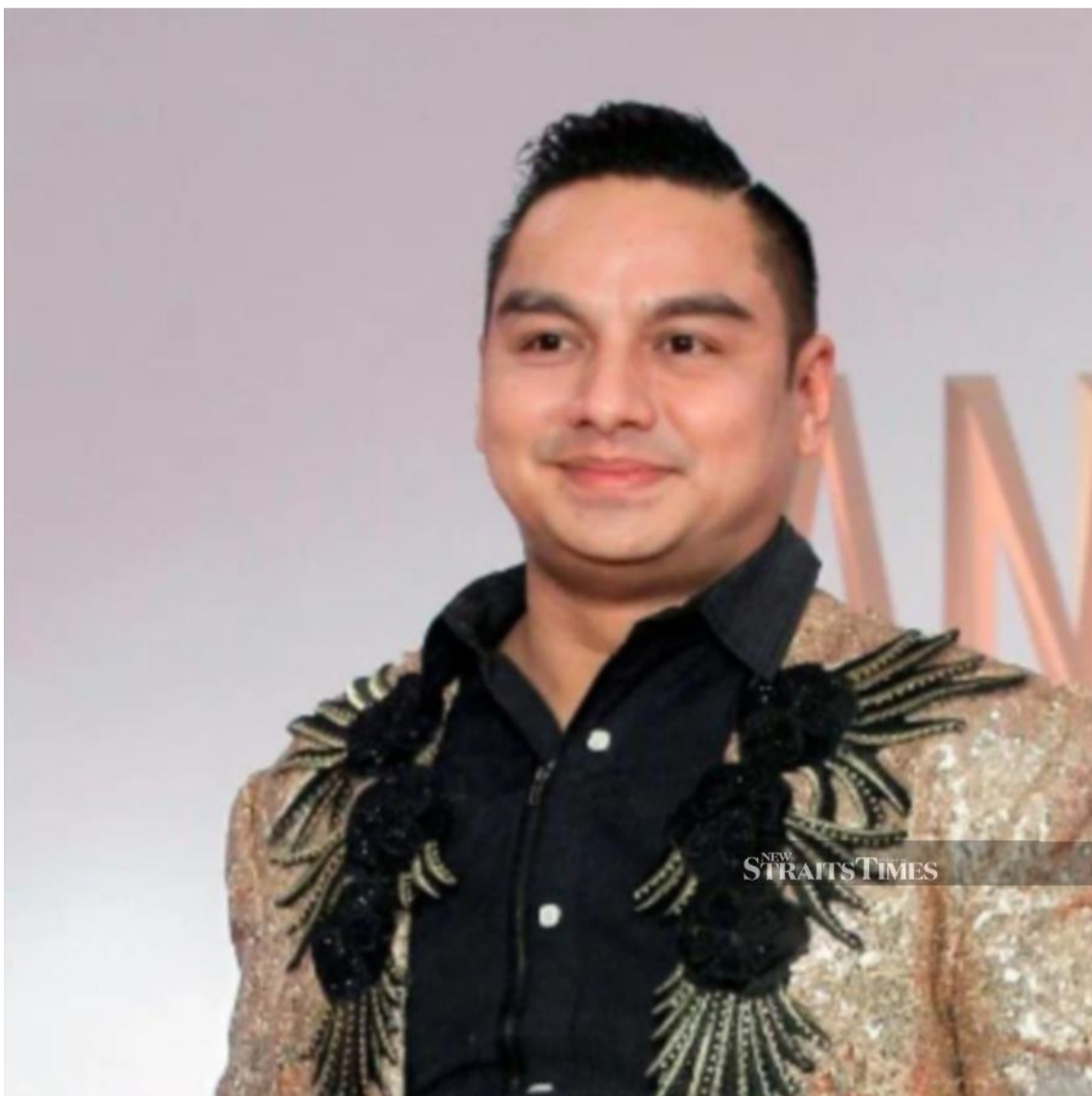
Datuk Boy Iman

KUALA LUMPUR: Actor and businessman Datuk Boy Iman has been declared bankrupt by the Kuala Lumpur High Court.